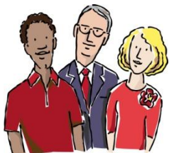
Wear Red for Pentecost

On Wednesday, May 9 th , The Center on Healthy Aging will be presenting a free program on fall prevention at 1:00 pm right here in our Family Life Center. The program is called S.A.F.E. ( Stopping Accidental Falls in Elders ). Please come to this workshop to have a free Fall Screening assessment. This workshop also includes a demonstration on how to get up from a fall. We will be having refreshments. Hope to see you there!