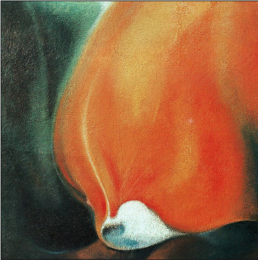
"Seed Resurrection" by Frank Wesley

111 Drum Point Road, Brick, NJ 08723 732-477-0676 BrickPresby.com Brick.Presbyterian@Verizon.net